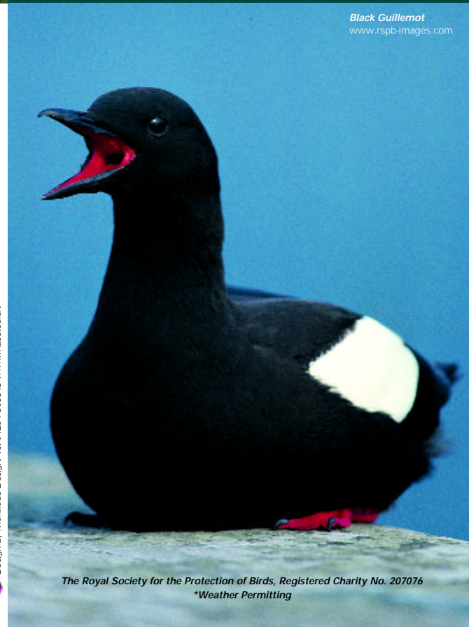
Black Gullmott

Design by Montfode Design. Tel 01204 600948 www.mdf3.co.uk